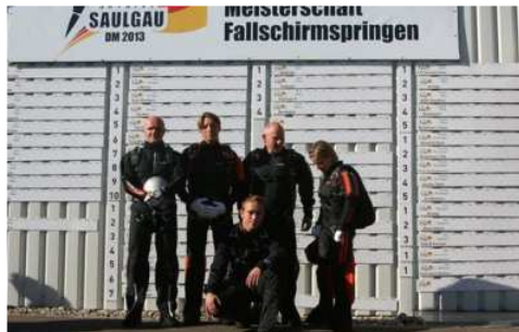
Team Karma at the German Nationals 2013

Team Karma's goal was to compete for the medals, and the leaderboard is showing that the bronze medals were in reach. The two top teams were too strong, and even the desired 10-average level would not have been enough to challenge the gold and silver medal teams. However, Team Karma tied and outscored the bronze medalist Das KOs Saar two times and still ended up too far behind at the end.